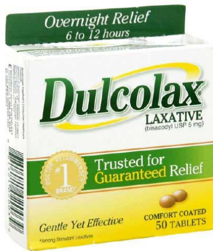
OTC – only 2 tablets needed