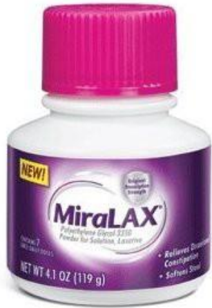
119g OTC - generic okay