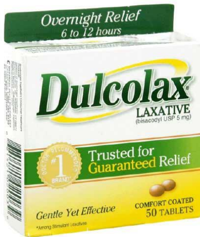
OTC – only 2 tablets needed