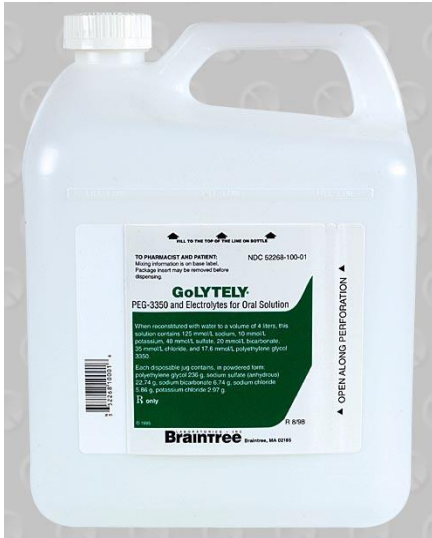
2 Bottles - Prescription required

_____ Two lemonade-flavored Crystal Lite tubes can be added to the bottle of GoLyteLy/NuLyteLy for flavor, if desired.